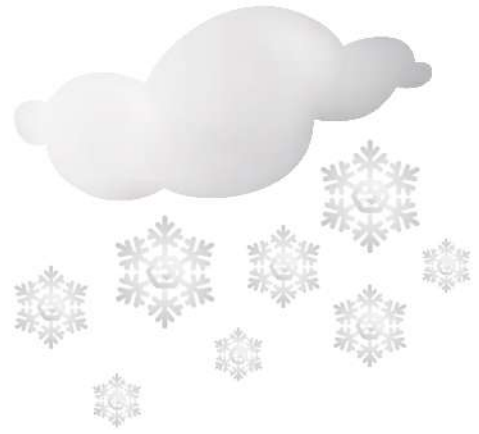
Bwrw Eira Snowing