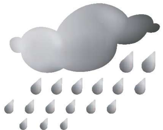
Bwrw Glaw Raining