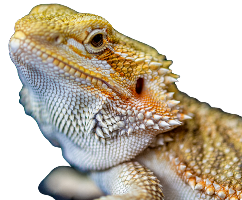
Lizard / Madfalli