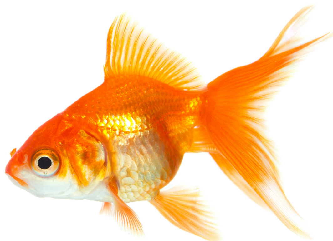
Gold Fish / Pysgodyn Aur