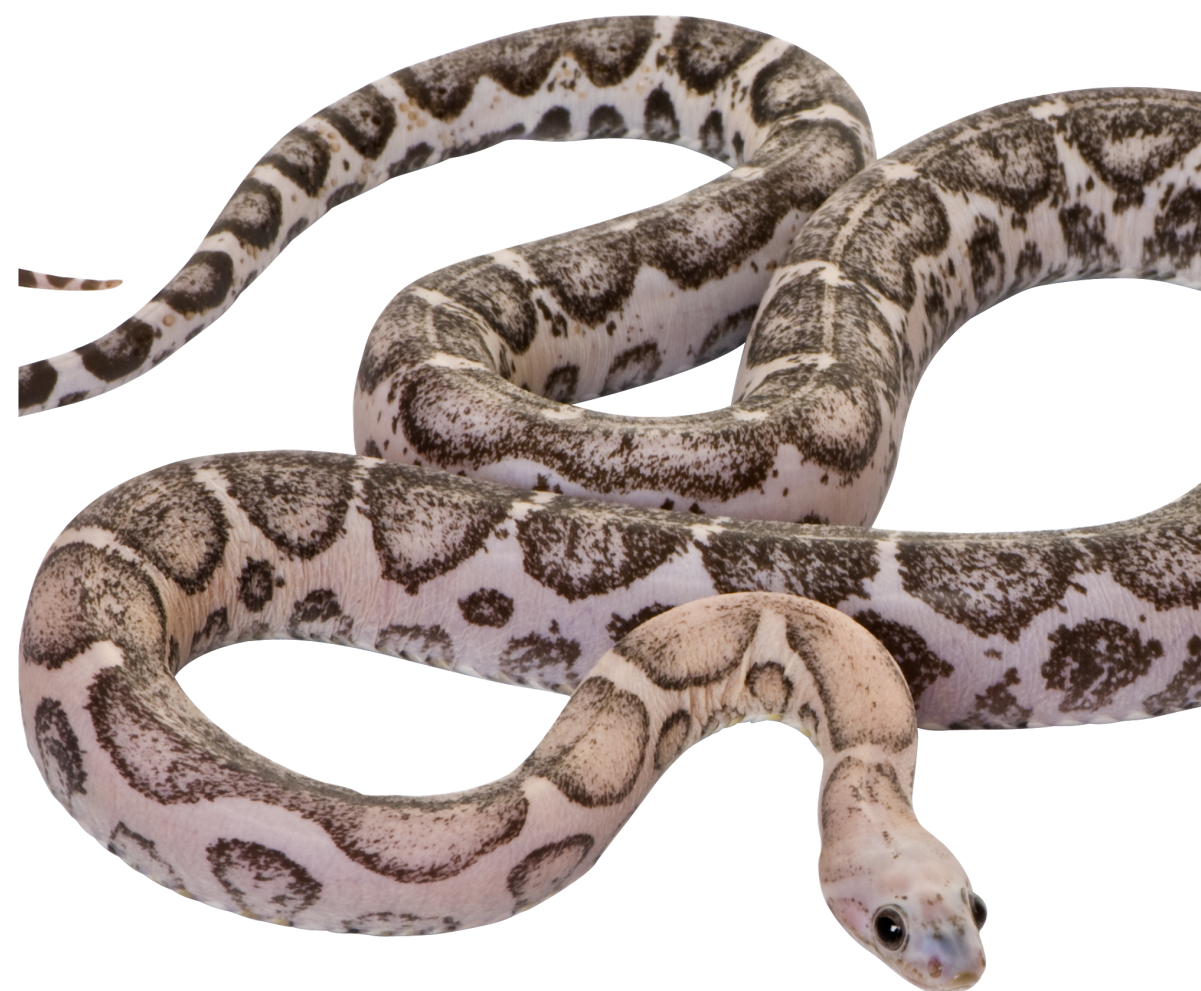
Snake / Neidr

Early Years Wales Blynyddoedd Cynnar Cymru