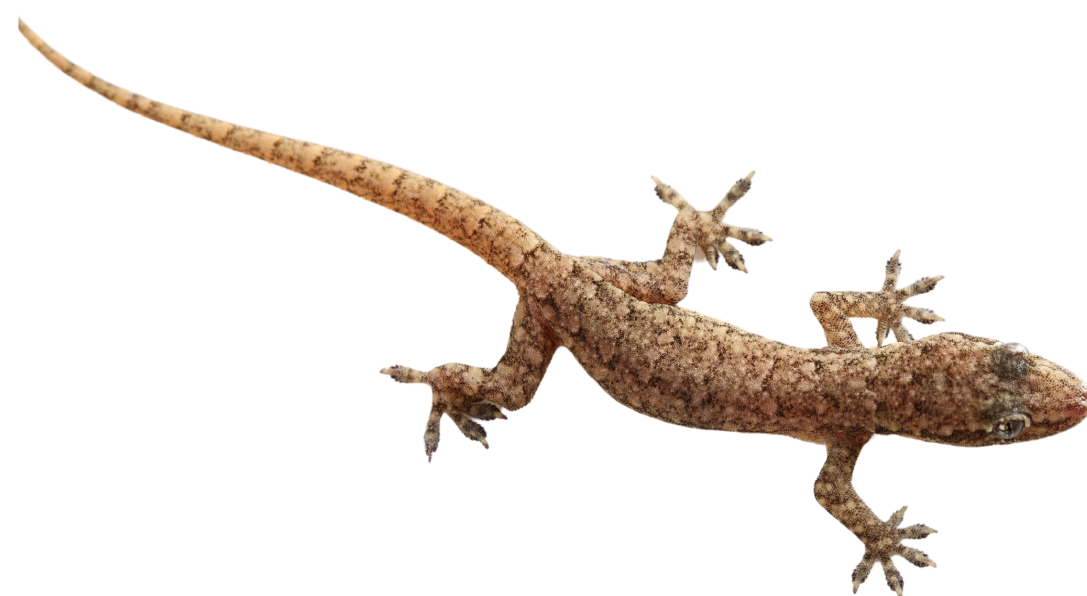
Gecko / Geco