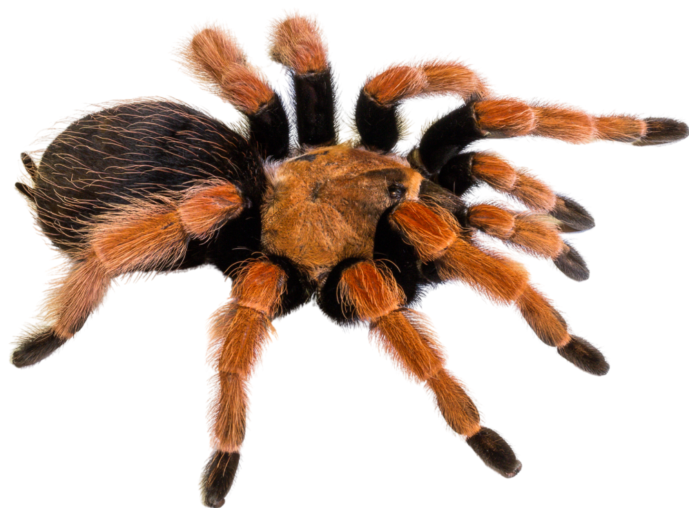
Tarantula / Tarantwla