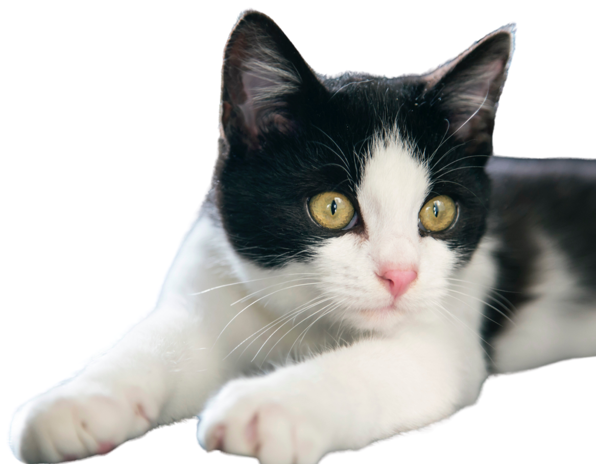
Cat / Cath