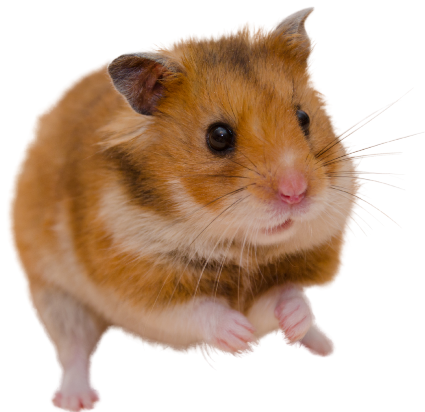
Hamster / Bochdew

Early Years Wales Blynyddoedd Cynnar Cymru