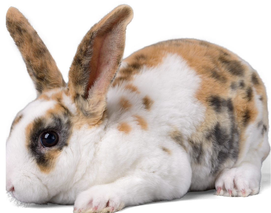
Rabbit / Cwnignen