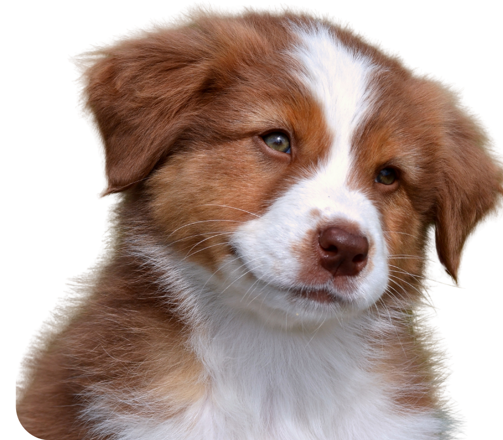
Dog / Ci