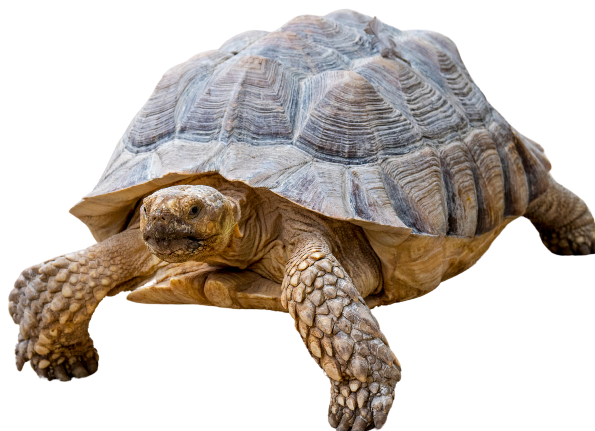
Tortoise / Crwban