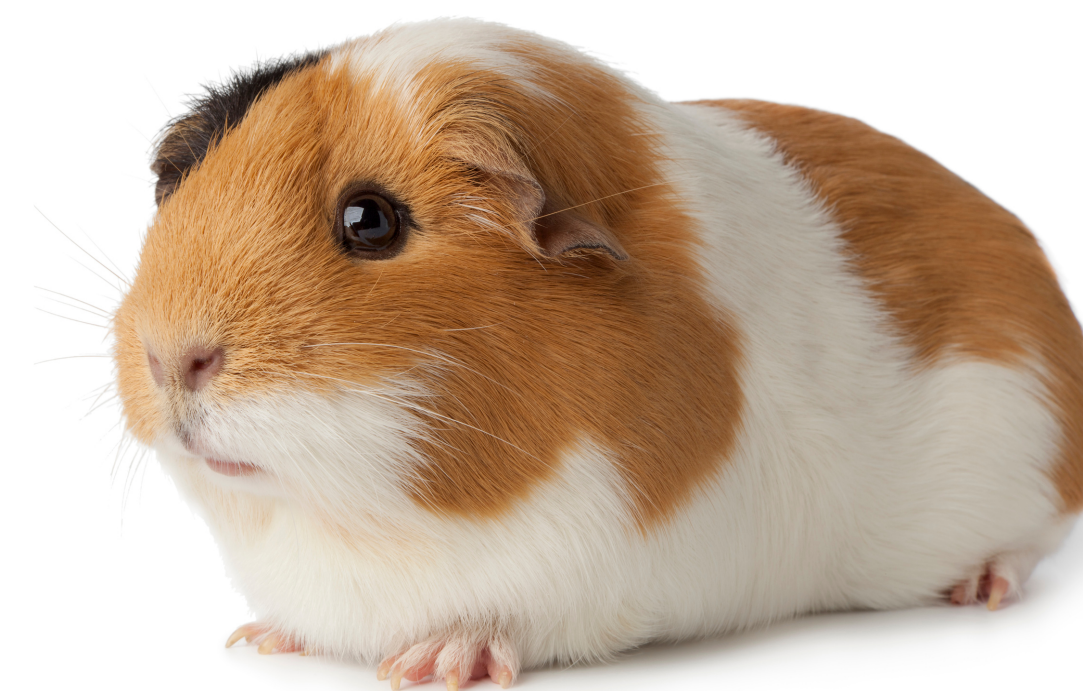
Guinea Pig / Mochyn Cwta