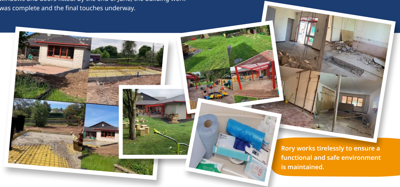
Rory works tirelessly to ensure a functional and safe environment is maintained.

It is in testimony to Rory that the build was completed on time.